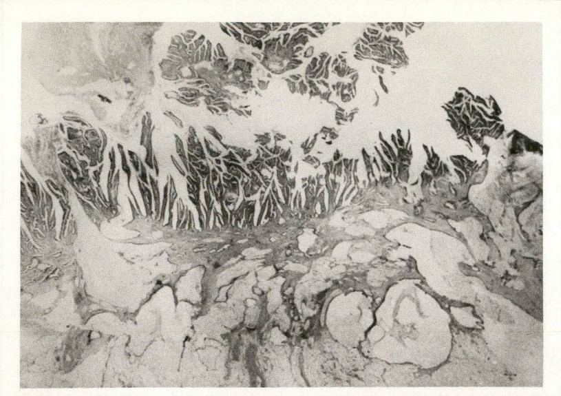
Figura 3 – MAVA - H \& E \times 6 . Pools of mucus spreading from the base of villous crypts, infiltrating profusely the extramuscular fattissue. Note the incomplete epithelial coating (predominantly near the base of the adenoma) of many mucinous lakes.

(Fig. 1), with features of a villous or tubulovillous adenoma, flattened and nonpeducula ted, on the surface (subgroup c). The villi were separated by deep crypts and showed variable degrees of intraepithelial dysplasia with scant mucin production, though isolated hypersecretory areas could be identified.