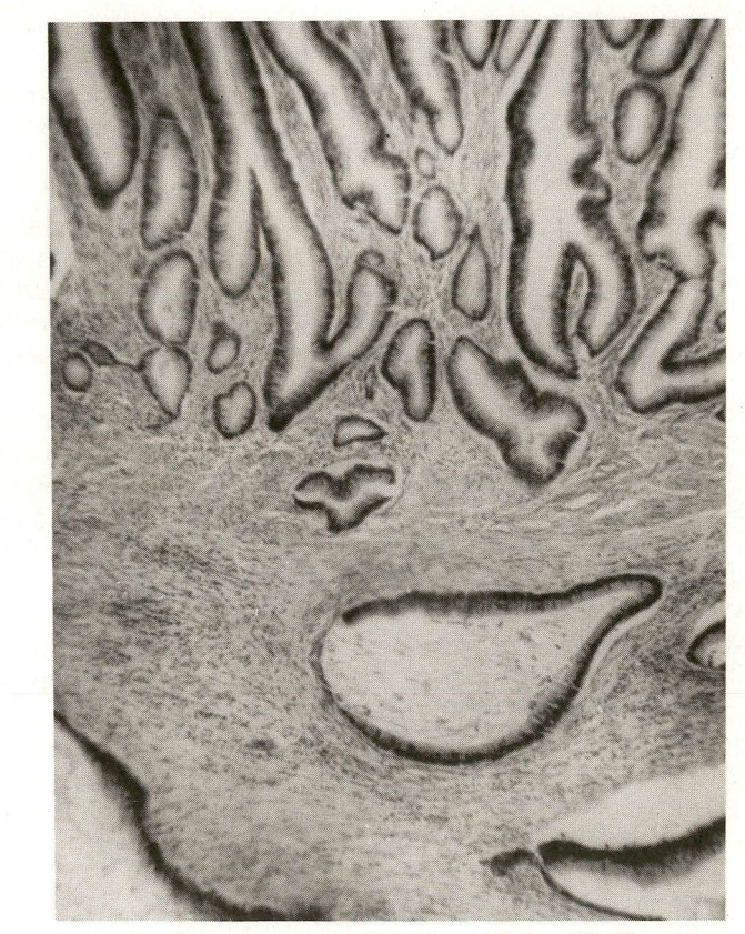
Figura 2 — Deep portion of a MAMA — H \& E \times 100 . The villous adenoma crypts are going through the muscular wall, into the subserous layer, with moderate stromal reaction, showing mild dysplasia. In the upper part of the field there are muscular bundles preserved within the epithelial crypts and lacking of stromal reaction.

Figura 1 – Mucinous carcinoma arising in villous adenoma (MAVA) - H & E, x 6. Note that deep portions of the interpapillary crypts are projected up to the muscular wall of the colon. From the crypt bases arise pools of mucus, infiltrating the extramuscular fat. At the center and in the right side there are lakes of mucus with superficial epithelial coating, but without epithelia in their deepest areas.