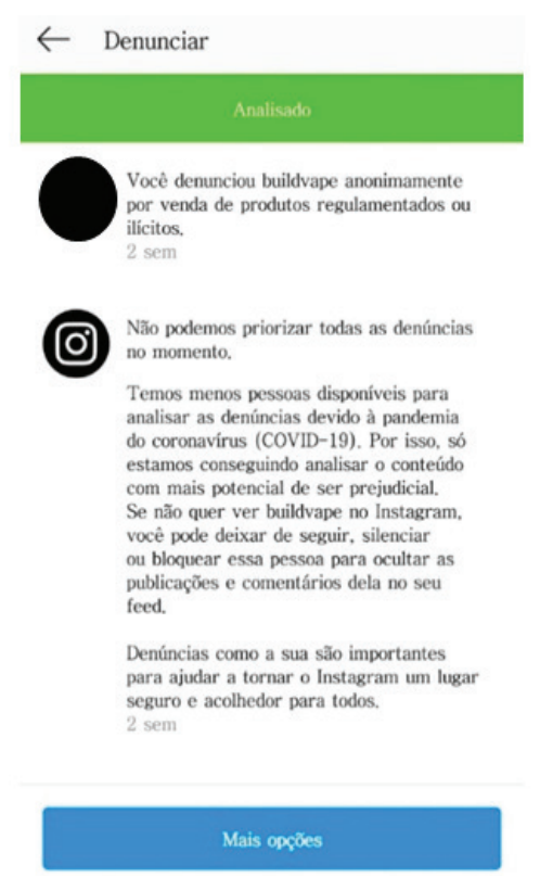
Figure 3. Instagram automatic response to the complaints of ESDs advertising content

Digital marketing creates a responsibility gap further to regulatory uncertainties. The formulation, approval and implementation of control policies can be a morose process, but adjustments are urged to be made and constantly revised following the evolution itself of the technology and media in addition to regulation monitoring and implementation.