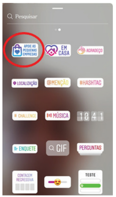
Figure 1. List of sticker of Instagram Stories Note: The sticker "Support small business" appears highlighted as the first sticker.

profiles of these products started to adopt the sticker to promote products and retailers. The records show e-juices or e-liquids (substances utilized in the devices to add flavor and aroma), accessories for vapes, devices to vape and/or any other vaping-related image.